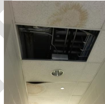
Maintenance issues at the current laboratory

$65.5 million is proposed in Rebuild Illinois for the land acquisition and planning of a new Illinois State Police combined crime laboratory and administrative facility. The current Joliet Forensic Science Laboratory, built in 1964, is responsible for work products that directly affect the criminal justice system and services over 200 law enforcement agencies. The current facility was neither designed for nor can adequately support the technology necessary in the modern forensic science environment. Frequent incidents such as power outages, HVAC issues and the re-tasking of analytical staff to deal with these issues has also unquestionably impacted the volume of case analysis the laboratory can produce. A significant amount of analytical time is lost when these systems repeatedly fail. A combined facility will enhance operational efficiencies and generate savings from reduced lease space and yearly repair and maintenance costs of approximately $1.25 million.