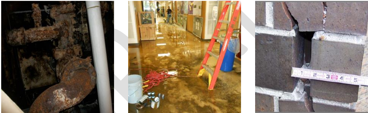
Deferred maintenance projects at public universities.

Illinois' universities and community colleges educate the workforce of tomorrow. Lack of investment and a two-year budget impasse have delayed critical projects at colleges and universities, hurt schools' operating budgets, and led to nearly half of the state's students leaving Illinois for college 7 – and often permanently. Deferred maintenance needs for public universities and colleges are estimated at nearly $6.7 billion. Rebuild Illinois provides over $2.4 billion to the Capital Development Board (CDB) for the Illinois Board of Higher Education and Illinois Community College Board to address statewide maintenance and programmatic construction at higher education institutions. This comprehensive plan addresses higher education needs across the state by providing resources to invest in Illinois' nine public university systems, nearly 50 community colleges and the Illinois Mathematics and Science Academy (IMSA).