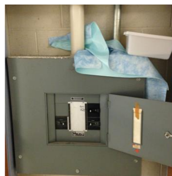
Frequent leaks threaten the electrical system at the current laboratory.

$126 million for the Department of Public Health for a new Cook County Public Health Laboratory. The Illinois Department of Public Health laboratories are the backbone of many public health functions and are designed to provide unique and essential testing and surveillance. The Chicago facility is the state's largest. It has deteriorated over the past four decades, jeopardizing the state's ability to respond to public health issues. Funding will allow CDB to construct a new, state-of-the-art facility that meets federal bio-safety requirements. This ensures CDB can continue to secure federal funds and will allow for efficient and effective laboratory operations.